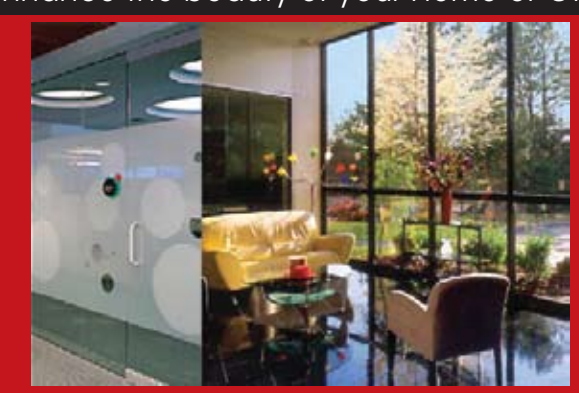
Add style, distinction, and value to your property Choose from the variety of shades available.

Enhance the beauty of your Home or Office